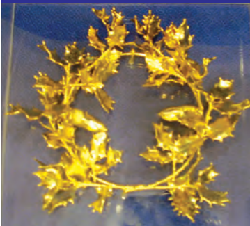
Golden myrtle crown from the tomb of Philip of Macedon